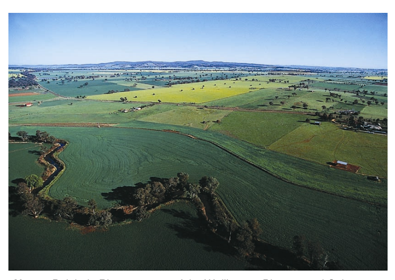
Above: Belubula River